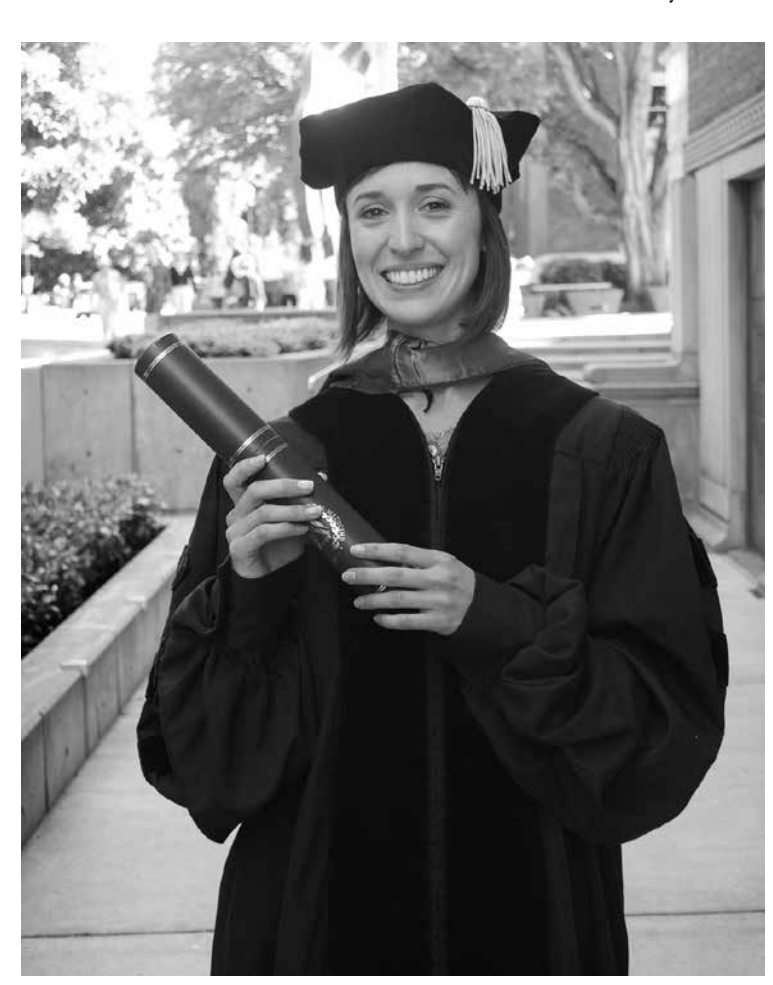
Our alumni are dedicated naturopathic physicians and Chinese medicine practitioners who treat thousands of patients each year; they are researchers expanding integrative medicine.

NCNM has a network of over 2,200 alumni across the United States, Canada and in many other countries. Our alumni are dedicated physicians and acupuncturists who treat thousands of patients each year. As part of their commitment, our alumni often talk with prospective students about careers in natural medicine. If you would like to visit with one of our alumni in your area, please call the Office of Admissions for a referral.