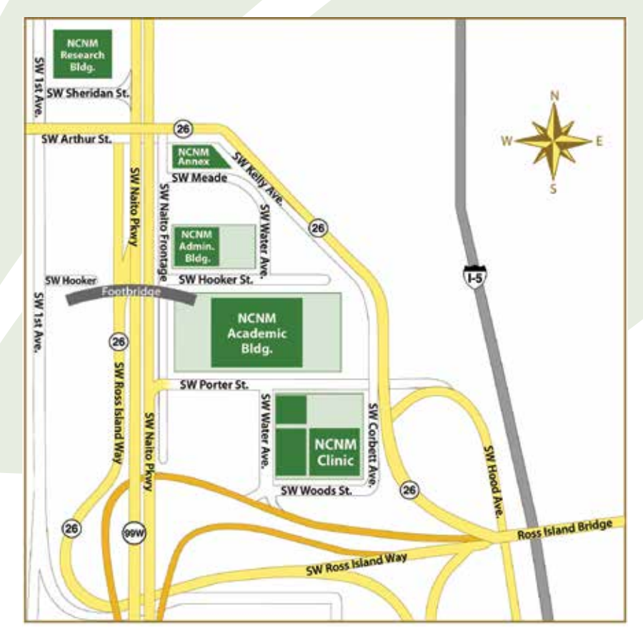
For detailed directions, from anywhere in the Portland area, please visit www.ncnm.edu. Under Quicklinks, click on directions.