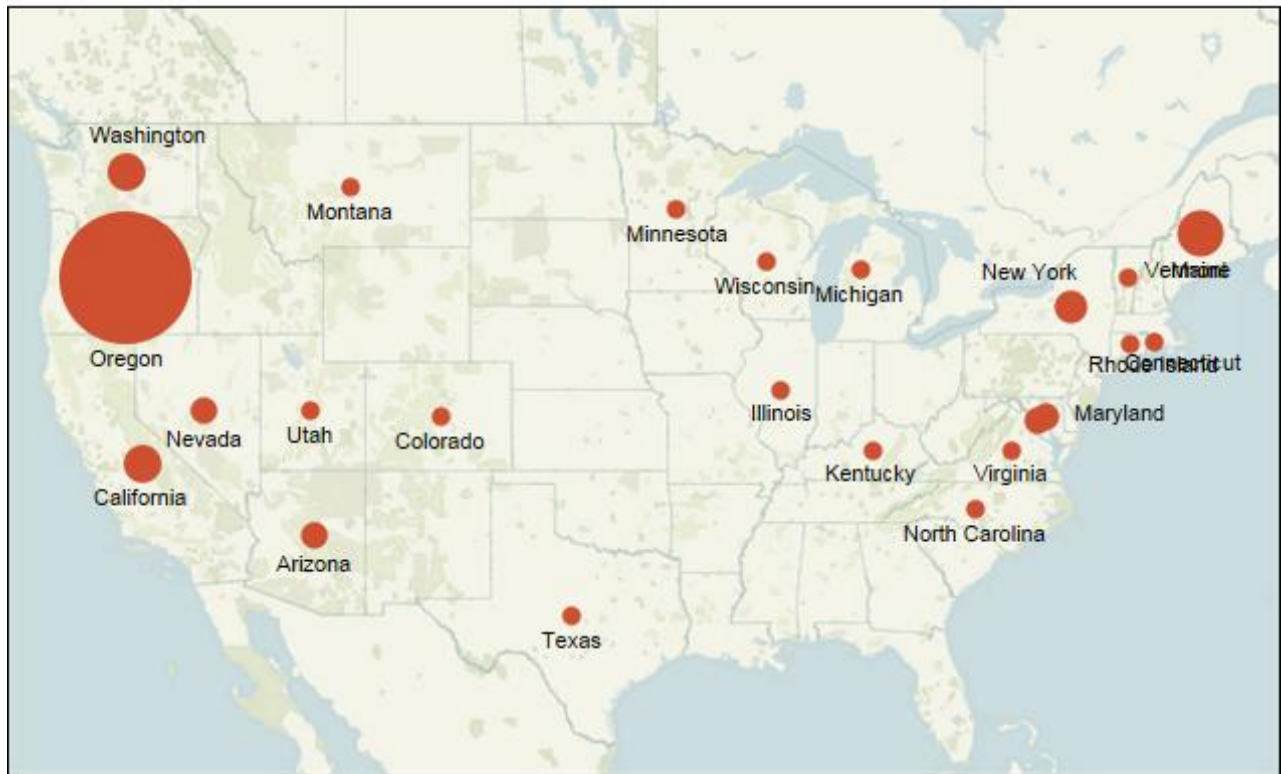
CCM PRACTICE LOCATION BY STATE – MAP (total responses = 91, includes those practicing in more than one state)