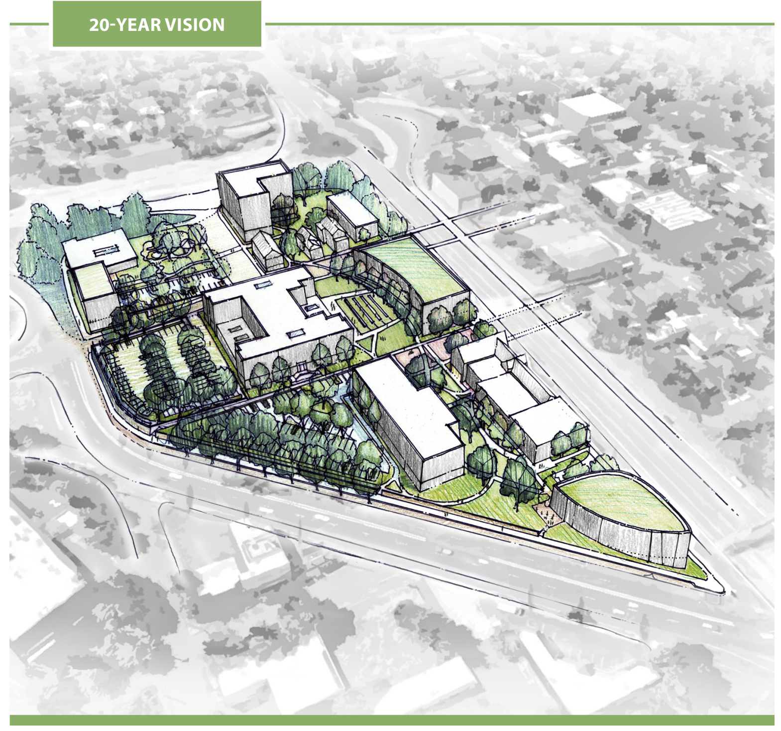
The NCNM Master Plan strives to create a magnificent, urban, green space in which to educate the natural medicine practitioners and physicians who will become the leaders in health care. Rendering of the NCNM Campus–view to the south.