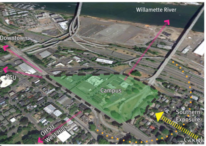
Figure 2. NCNM Location

NCNM currently consists of the School of Naturopathic Medicine, the School of Classical Chinese Medicine, and the Helfgott Research Institute and Community Education Center. Within the Institute, the new Master of Science in Integrative Medicine Research has been initiated. Dual