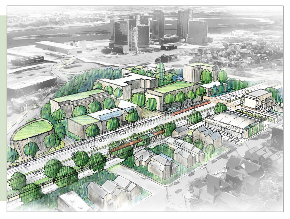
The plan for NCNM will serve not only its students but also the surrounding neighborhood and city as well. Rendering of SW Naito Parkway and the NCNM Campus.

The 20-year plan for the NCNM campus integrates the vision for the campus with the opportunities found on site. It is a grand plan to create a magnificent urban campus, but one that allows for flexible and incremental improvements.