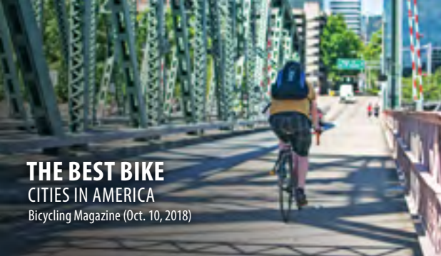
THE BEST BIKE CITIES IN AMERICA Bicycling Magazine (Oct. 10, 2018)